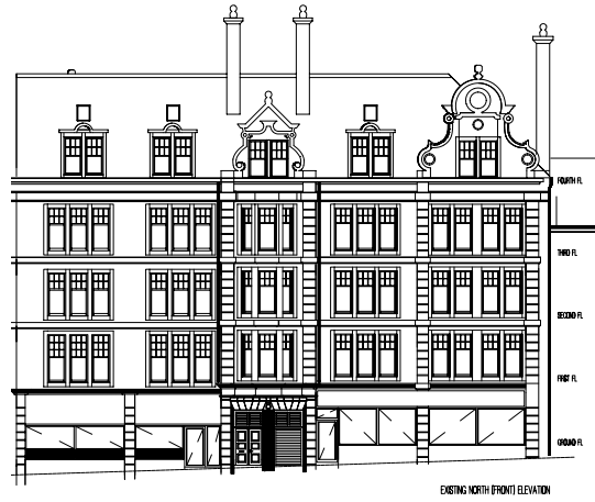
Drawing detail for a listed building conversion in the centre of Newcastle upon Tyne, North East of England.